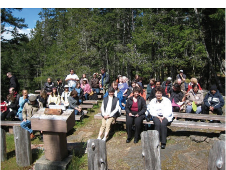
MTH at the outdoor chapel.