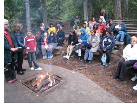
Evening bonfire ceremony.

Calendar Summary: (for complete listings, click here )